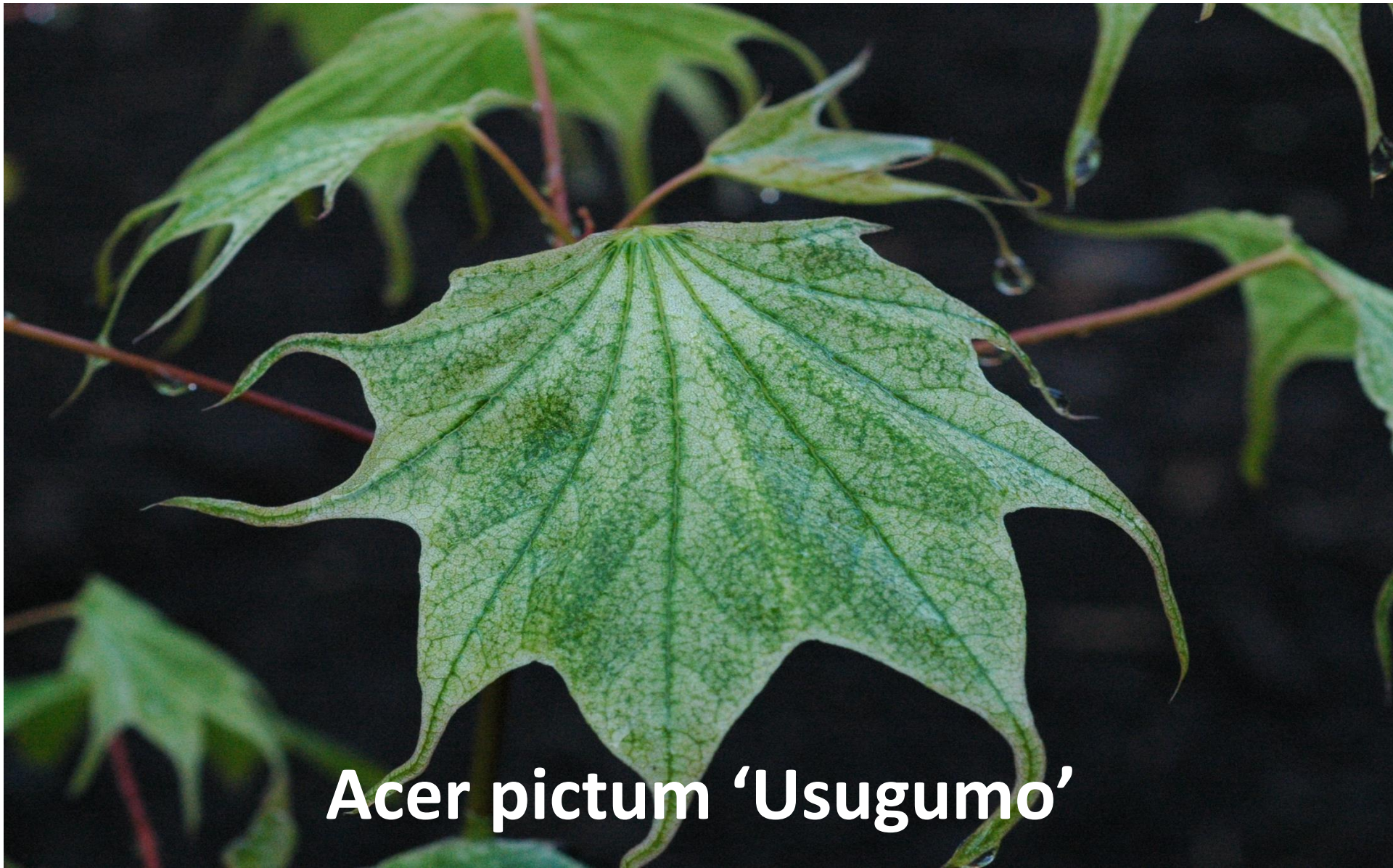
Acer pictum 'Usugumo'

This is a collector's garden containing over 3,000 plants and in addition to the maple collection the garden has an extensive conifer collection with over 600 plants and hundreds of other varieties of trees and shrubs including collections of unusual Beech, Ginkgo and Sciadopitys. I guess you could call my approach to design a classic mixed border only I used maples and other woody plants instead of perennials.