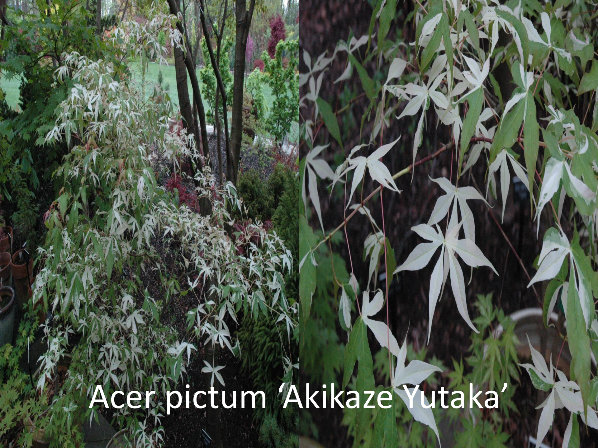
Acer pictum 'Akikaze Yutaka'