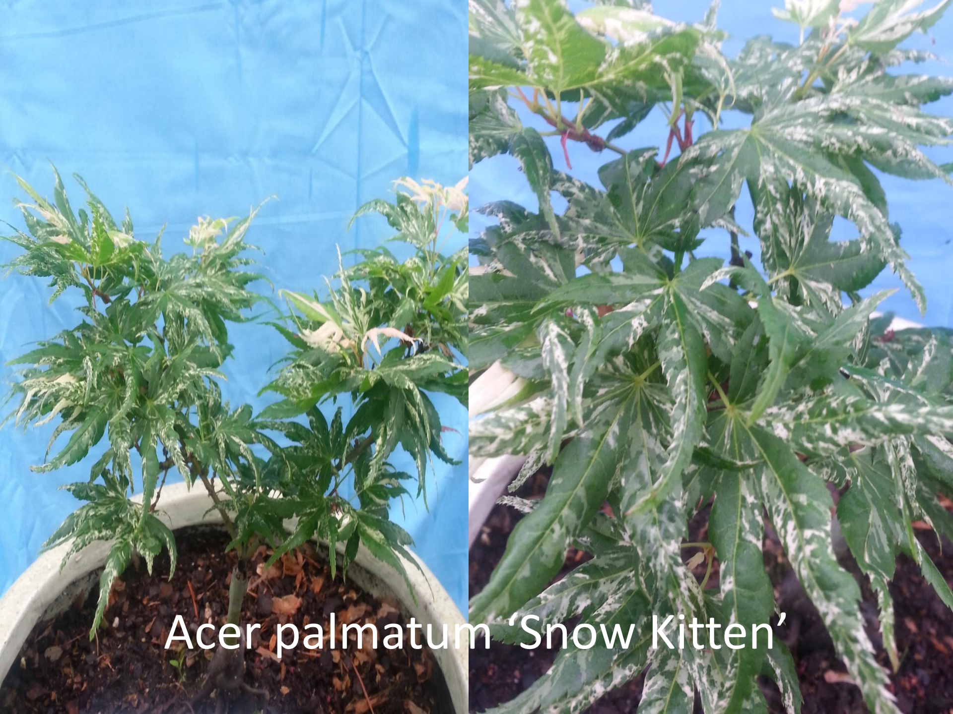
Acer palmatum 'Snow Kitten'