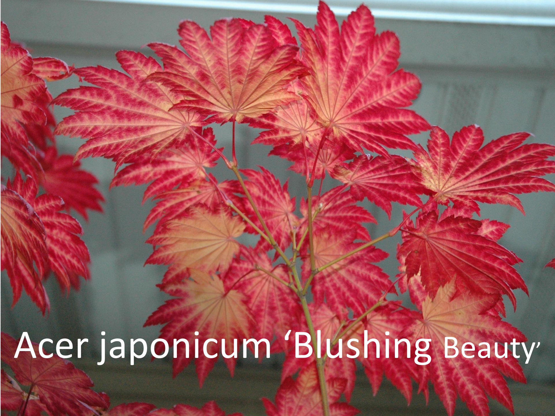
Acer japonicum 'Blushing Beauty'