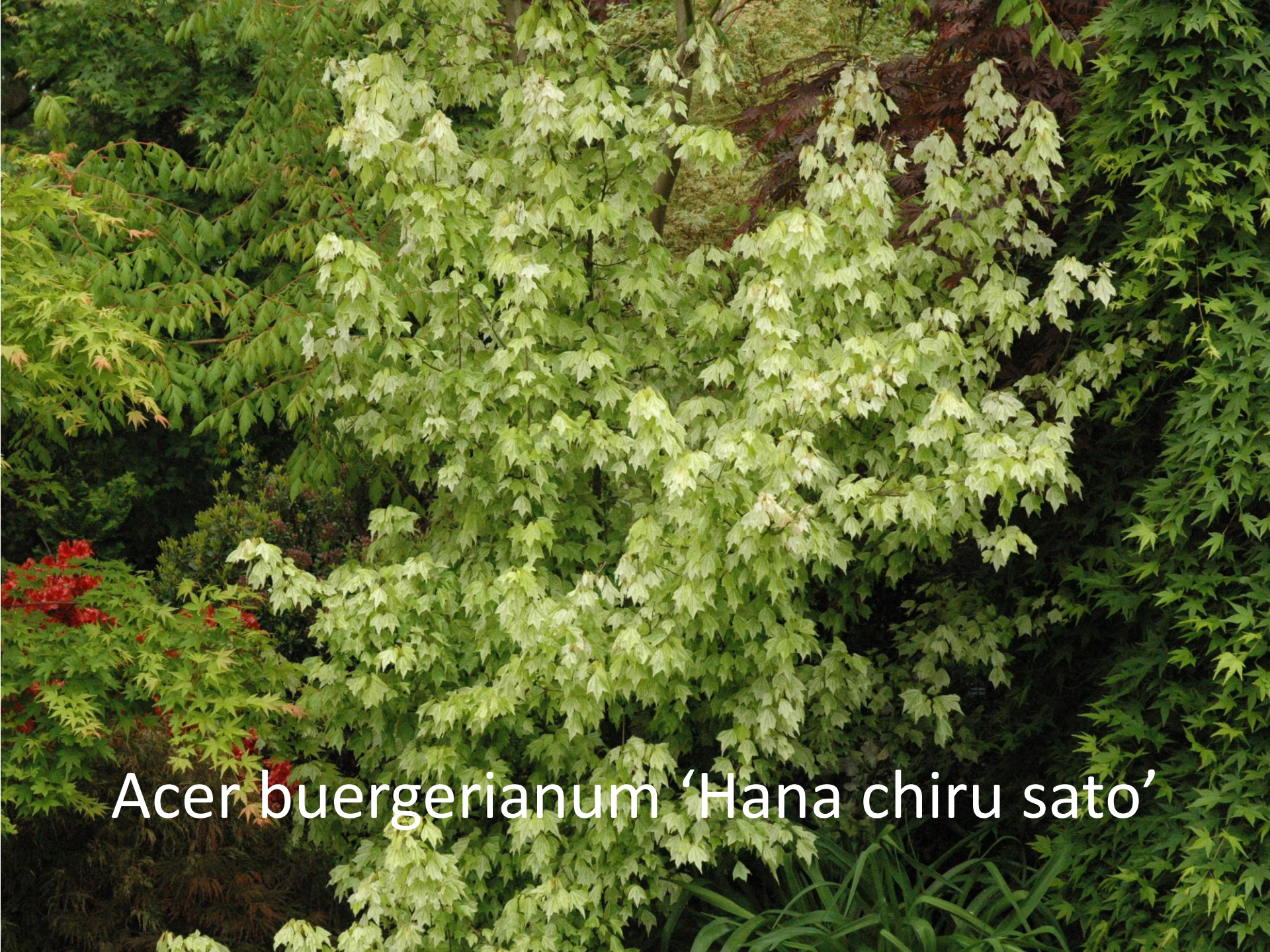
Acer buergerianum 'Hana chiru sato'